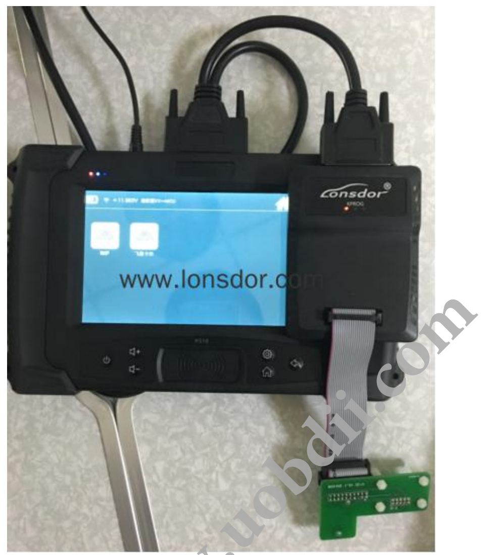
5.Read Volvo CEM please use RN 01 board: