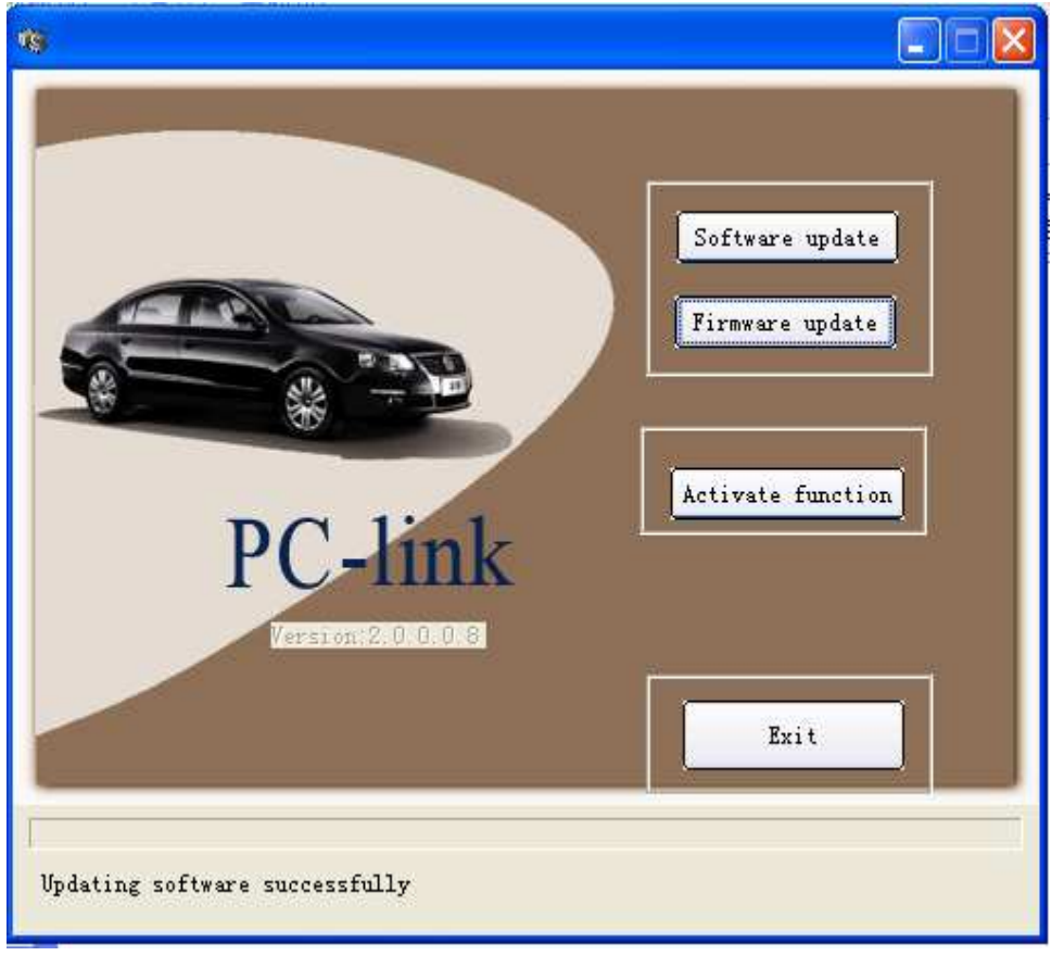
After updating successfully, you could exit directly.

You'll see the process of updating for about 20 minutes, please wait with patience, don't do anything until you see "Updating software successfully", shown as figures below